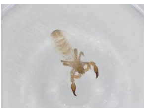
BIOUG82737-E05 [Microplate] Pseudoscorpiones Order: Pseudoscorpiones