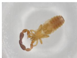
BIOUG82734-E06 [Microplate] Pseudoscorpiones Order: Pseudoscorpiones