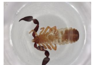
BIOUG82757-E02 [Microplate] Pseudoscorpiones Order: Pseudoscorpiones