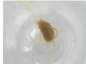
BIOUG85140-H01 [Microplate] Arachnida