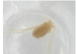
BIOUG85140-H03 [Microplate] Arachnida