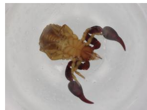
BIOUG82742-D06 [Microplate] Pseudoscorpiones Order: Pseudoscorpiones