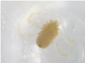
BIOUG85140-H02 [Microplate] Arachnida