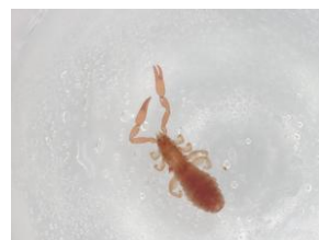
BIOUG85132-F10 [Microplate] Pseudoscorpiones Order: Pseudoscorpiones