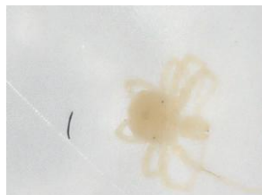
BIOUG82729-B09 [Microplate] Arachnida