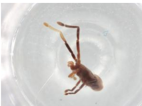
BIOUG82738-F12 [Microplate] Arachnida